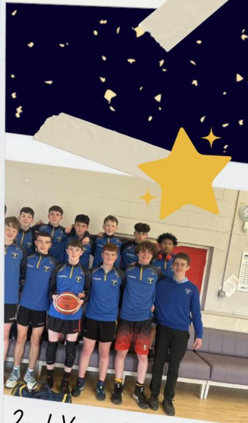
2nd Year Basketball