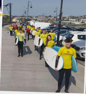
6th yr Trip