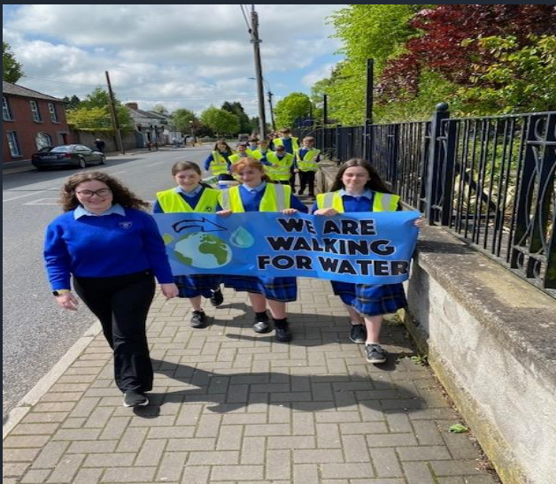
1 st Years walking with their banner during their Walk For Water.

On Friday the 12th of May the 1st years participated in a walk for water with the Green Schools committee. For many of us living in Ireland we take it for granted that we have easy and unlimited access to water, however 2 billion people in the world have to walk up to 6 km just to get a bucket of water. The aim of this walk is to raise awareness and money towards water and sanitations.